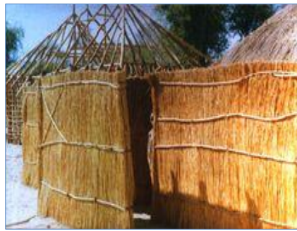
h) A hut with a thatched fence