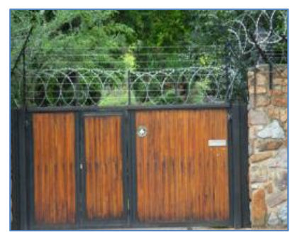
i) A barbed wire fence