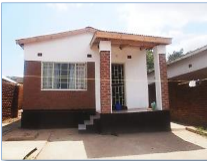
g) A house with a brick fence