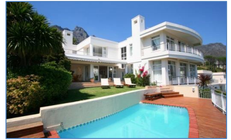
f) A villa