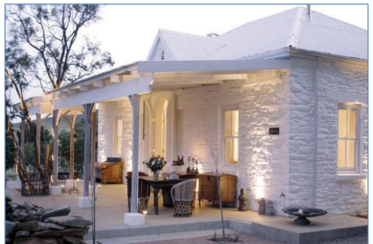
h) A whitewashed house