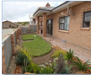
e) A red brick house