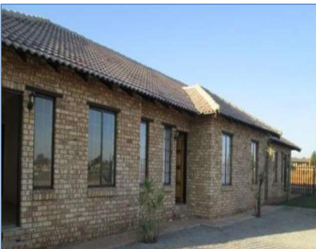
g) A quadro house