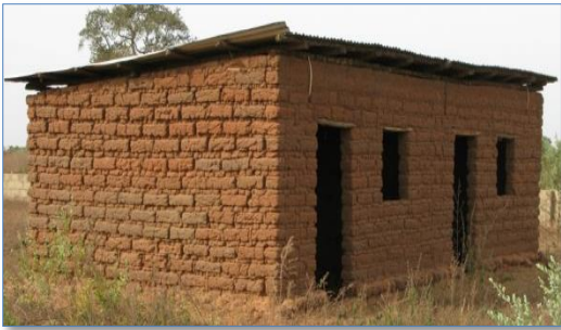
d) A red local brick house with iron roofing