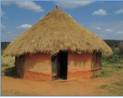
a) A mud hut